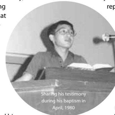
Sharing his testimony during his baptism in April, 1980

We have to enthrone Jesus once again in our lives, and truly live it out, not just pay lip service by singing about it in worship songs or talking about it!"