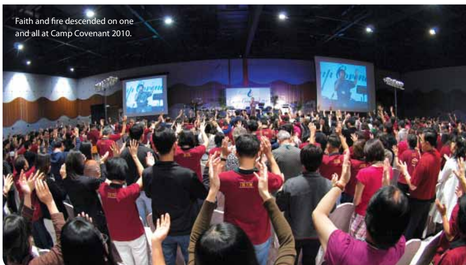
Faith and fire descended on one and all at Camp Covenant 2010.