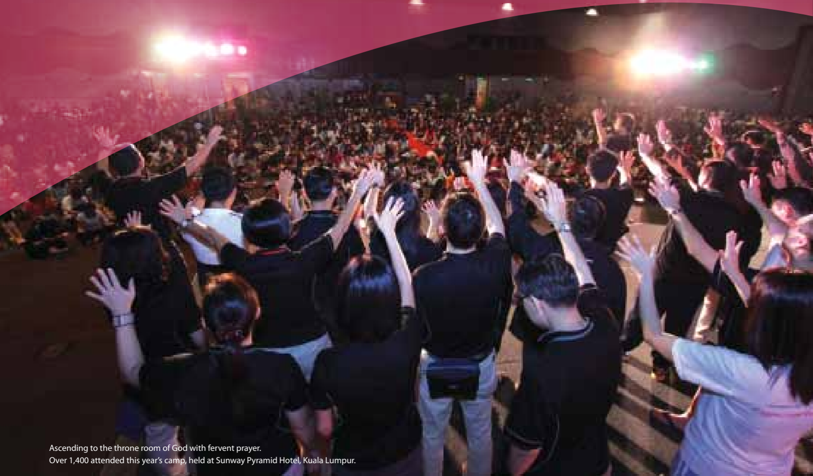
Ascending to the throne room of God with fervent prayer. Over 1,400 attended this year's camp, held at Sunway Pyramid Hotel, Kuala Lumpur.

explaining to us three specific signs (Matt 24:14, 24:15, 24:32–34) of Jesus' coming, as well as four parables that hold the keys to being ready for Jesus' return at all times: