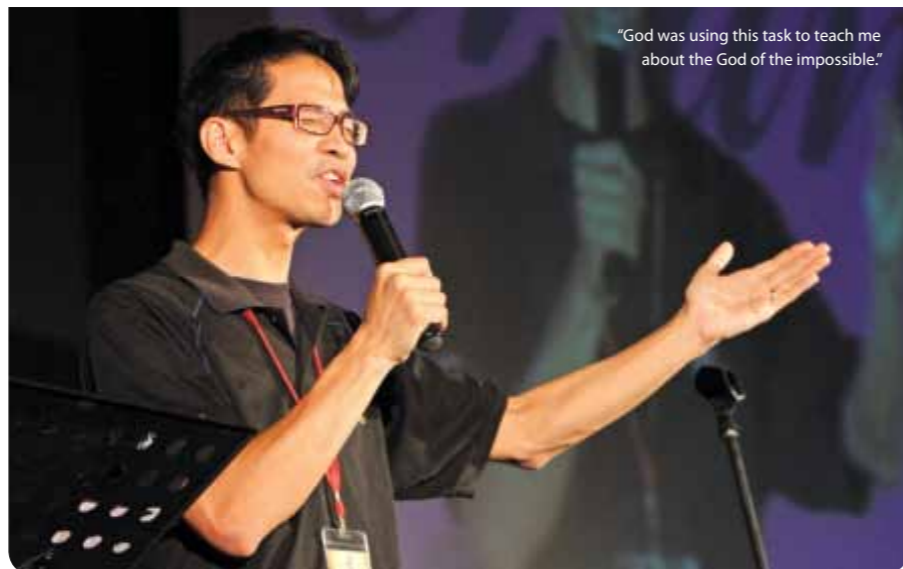
"God was using this task to teach me about the God of the impossible."